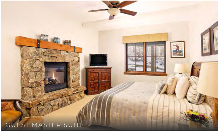
GUEST MASTER SUITE