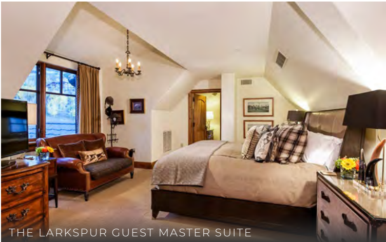
THE LARKSPUR GUEST MASTER SUITE