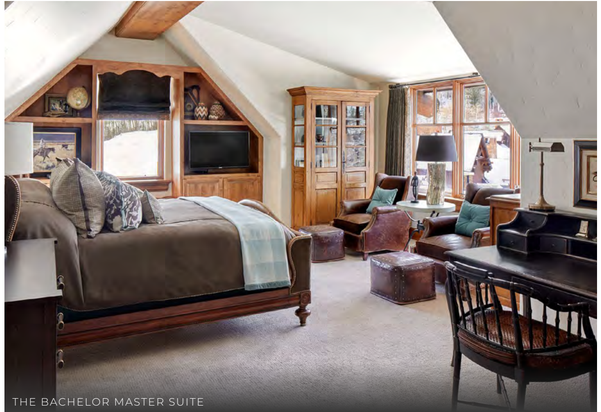
THE BACHELOR MASTER SUITE