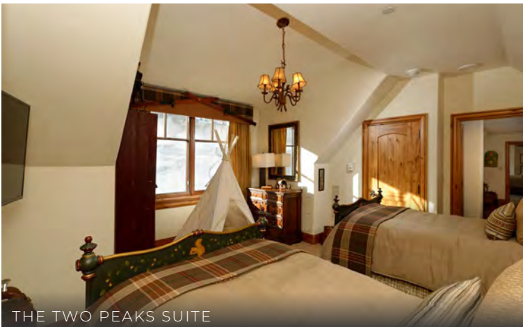
THE TWO PEAKS SUITE