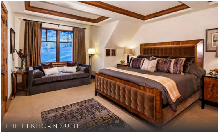
THE ELKHORN SUITE